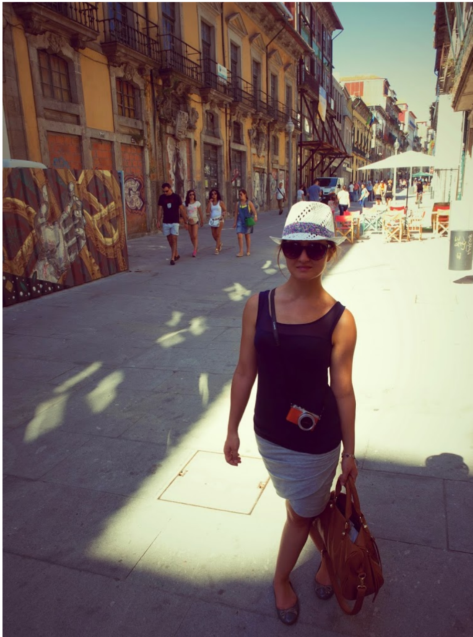
( http://www.thebrusselsprouts.me/wp-content/uploads/2014/07/P7120930-1.jpg )