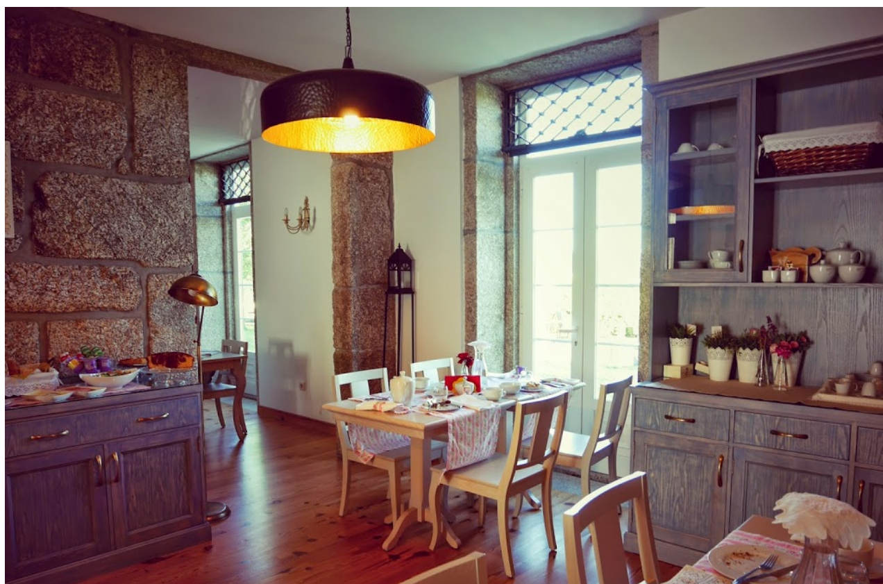
( http://www.thebrusselsprouts.me/wp-content/uploads/2014/07/P1000133.jpg )