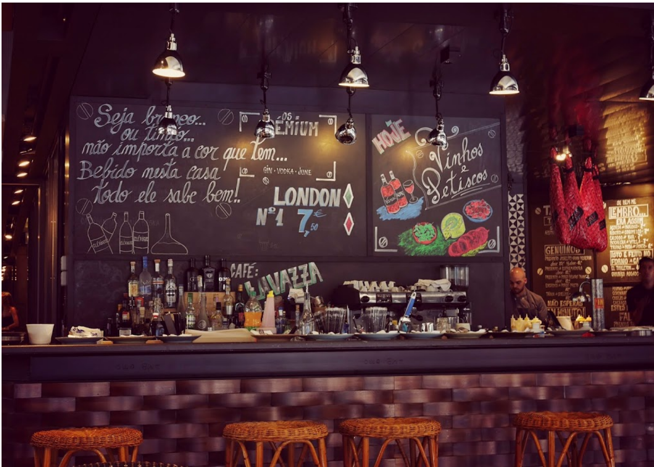
( http://www.thebrusselsprouts.me/wp-content/uploads/2014/07/P1000204.jpg )