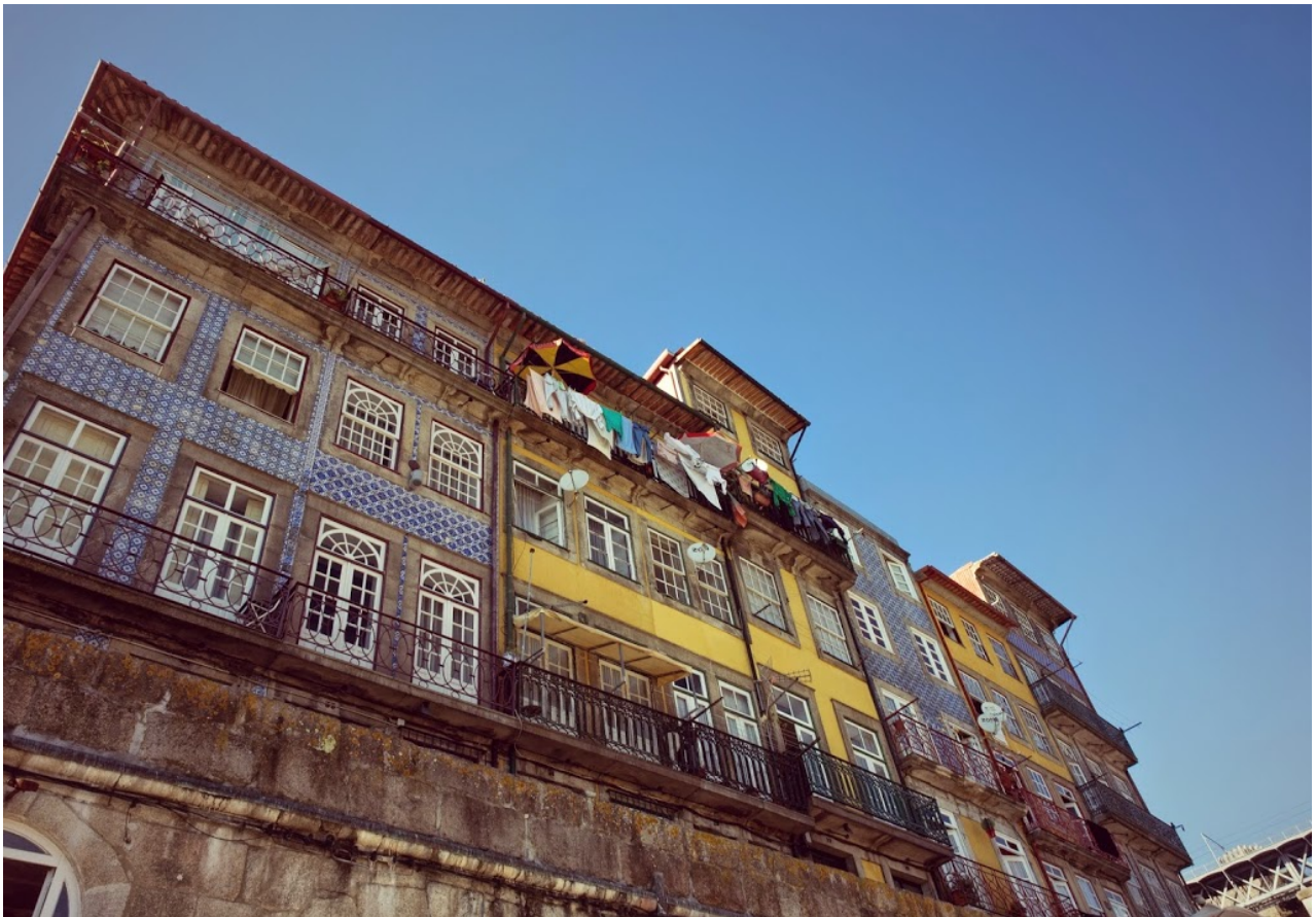
( http://www.thebrusselprouts.me/wp-content/uploads/2014/07/P7120972-1.jpg )

The long riverfront on the Douro is filled with restaurants and bars, offering the possibility to drink and dine with a view.