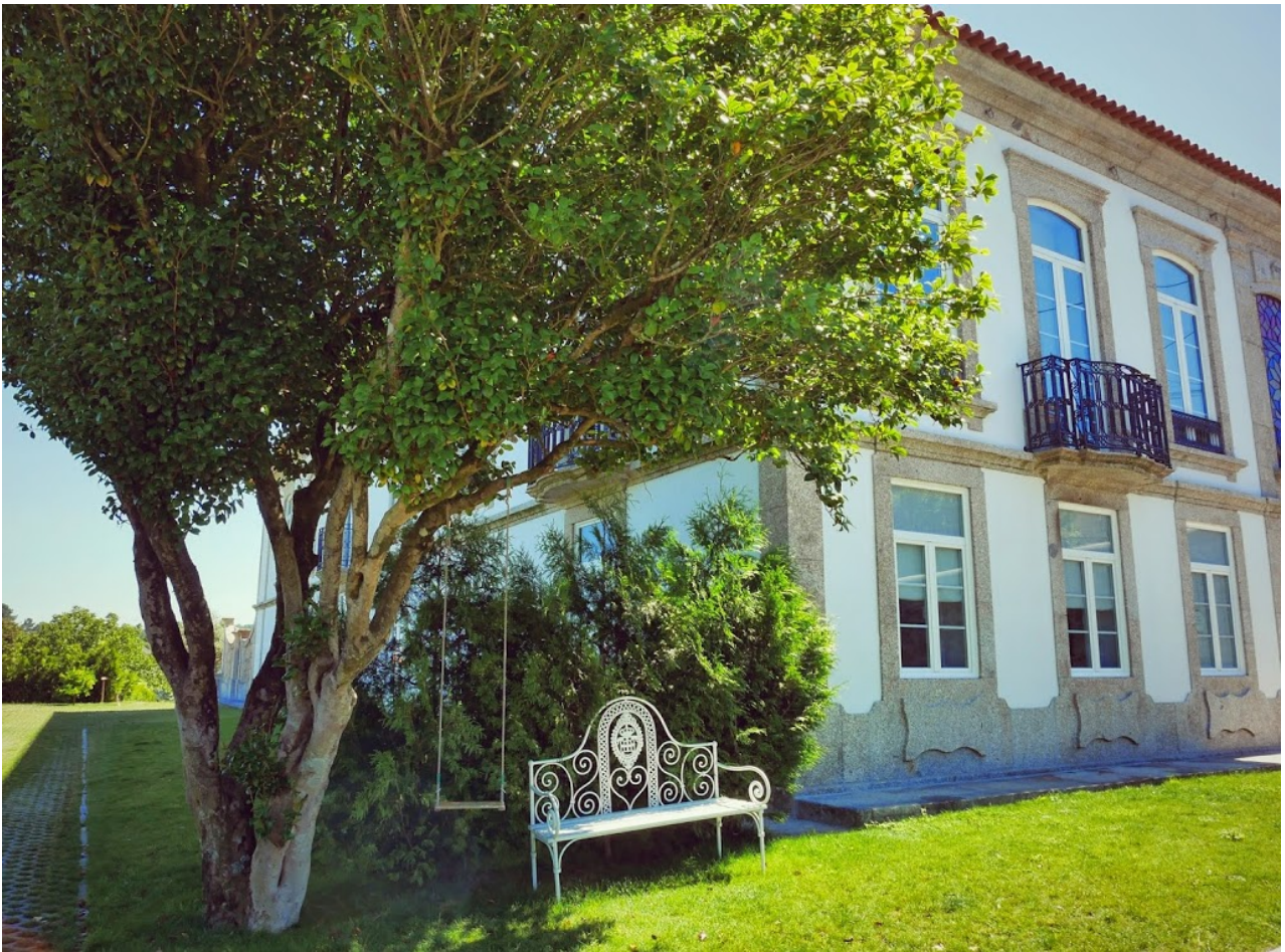
( http://www.thebrusselsprouts.me/wp-content/uploads/2014/07/P1000148.jpg )