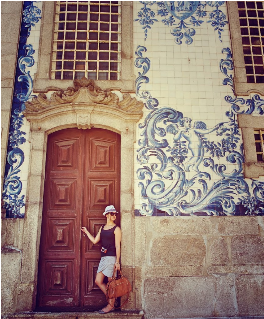
( http://www.thebrusselsprouts.me/wp-content/uploads/2014/07/P7120902-1.jpg )