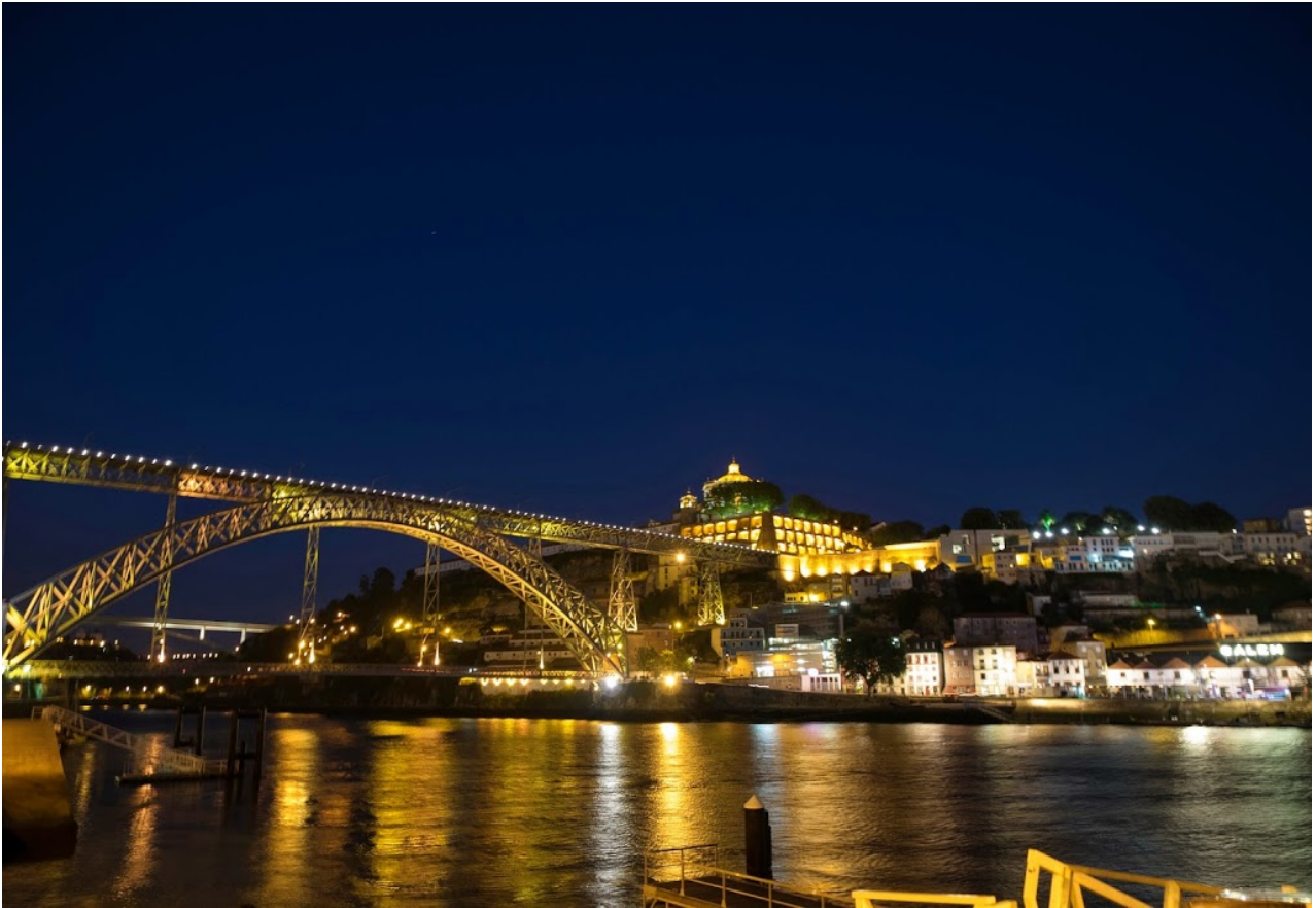
( http://www.thebrussel sprouts.me/wp-content/uploads/2014/07/P7131068-1.jpg )

Plus, it's definitely the place to be for Porto wine lovers ;)