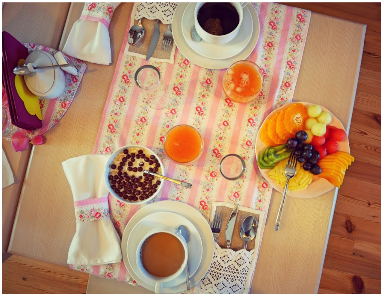
( http://www.thebrusselsprouts.me/wp-content/uploads/2014/07/P1000132.jpg )