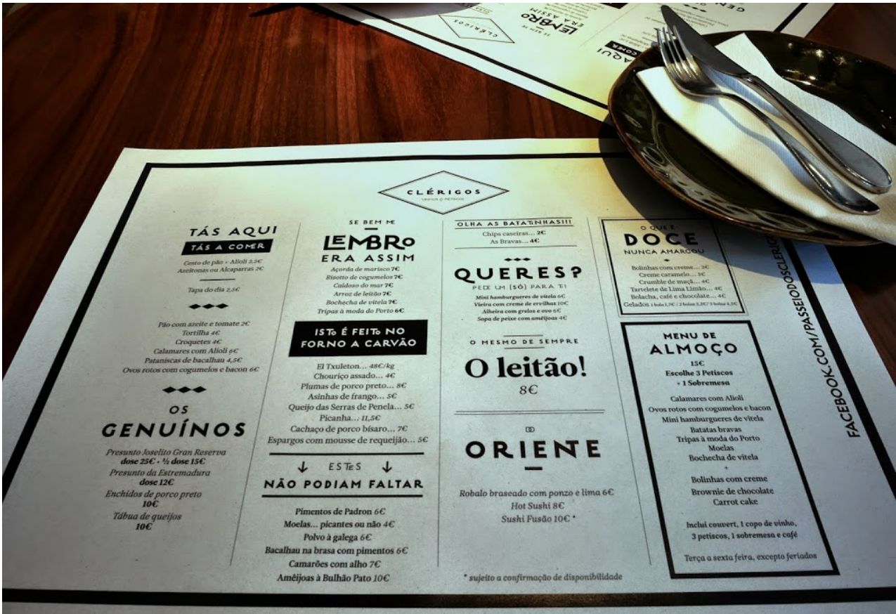
( http://www.thebrusselsprouts.me/wp-content/uploads/2014/07/P1000201.jpg )